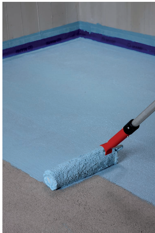
Application of the first coat of Mapelastc AquaDefense