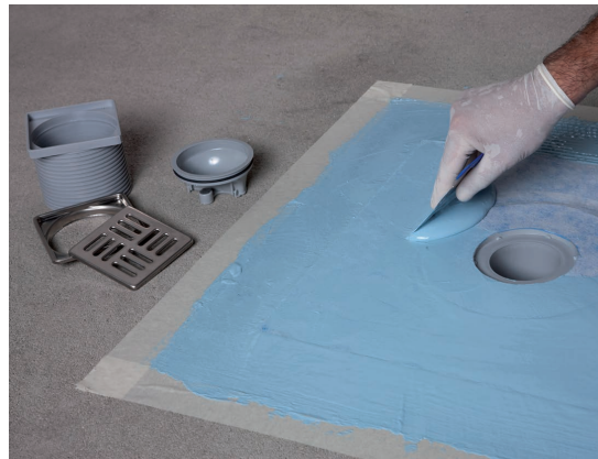
Impregnating Drain Vertical fabric with Mapelastc AquaDefense