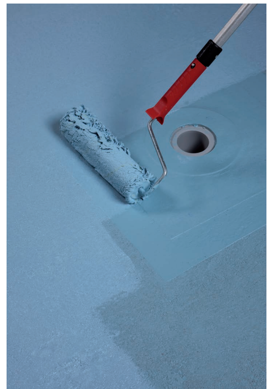
Application of the second coat of Mapelastc AquaDefense