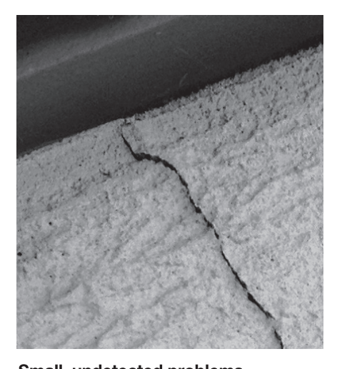
Small, undetected problems with plaster can become more serious problems in the future. Avoid both with regular maintenance.